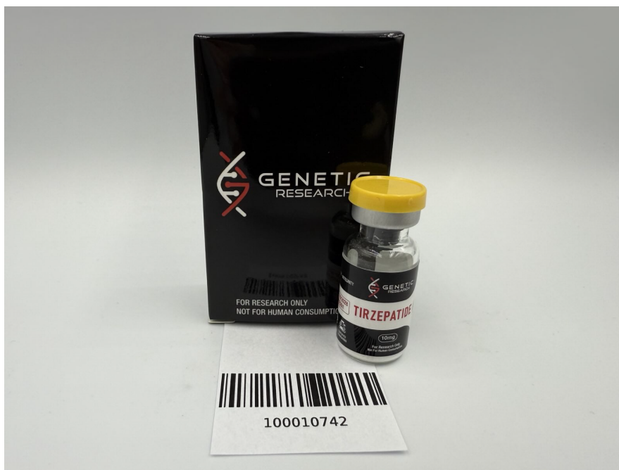
Photo of the test sample

The test sample was applied in the amount of 3 \mu l to the BioBasic 8 Thermo Scientific column. During the course of the analysis with the method a linear gradient in the solutions of H 2 O and Acetonitrile with the addition of 0.1% trifluoroacetic acid, a peak of the sought substance appeared. Its concentration, when compared to the reference chromatogram, is 10,48mg. Height the measurement error is + - 0,05 mg. The actual state of the sample sent before the test is presented on the photo below