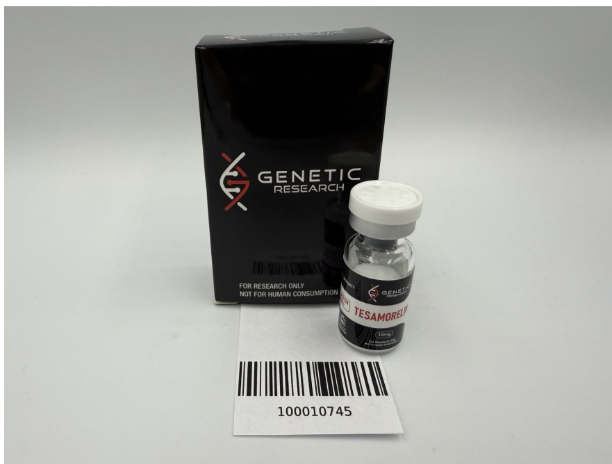
Photo of the test sample

The test sample was applied in the amount of 3 \mu l to the BioBasic 8 Thermo Scientific column. During the course of the analysis with the method a linear gradient in the solutions of H 2 O and Acetonitrile with the addition of 0.1% trifluoroacetic acid, a peak of the sought substance appeared. Its concentration, when compared to the reference chromatogram, is 10,51mg. Height the measurement error is + - 0,05 mg. The actual state of the sample sent before the test is presented on the photo below